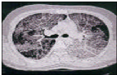
Figure 1 - High resolution computed tomogram showing thickened interlobular septa and alveolar shadowing mimicking crazy paving appearance.