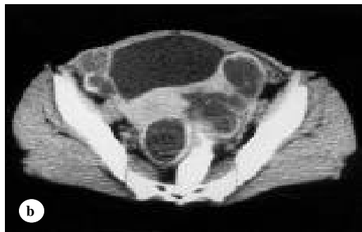
Figure 3 - Pelvic CT reveals, (a) multiple cystic lesions in the uterus and (b) bilateral multiple adnexial cysts.