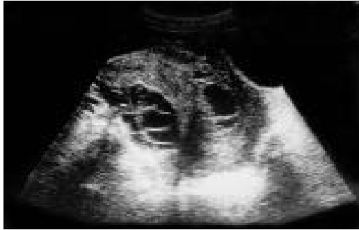
Figure 2 - Pelvic ultrasound displays multiple cysts at both adnexae and uterus.