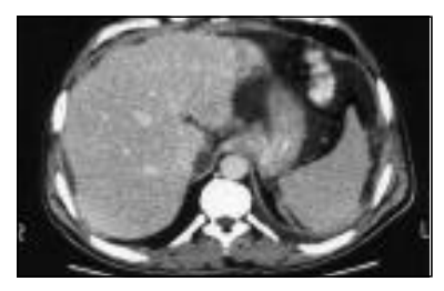
Figure 4 - Abdominal computerized tomography scan showing multiple, variable sizes, non-enhancing hypodense lesions of the left lobe of the liver, the largest measuring 2cm x 2cm with ascitis, due to Mycobacterium tuberculosis.

All patients received the standard anti-TB medications and 72 out of 75 patients completed the treatment. The length of treatment varied from 6 months (45 patients); 9 months (17 patients) to 12 months (10 patients). At follow up, the average weight of all patients before treatment was 46.5 kg and this rose to an average weight of 54.5 kg after the treatment. The percentage of weight gain in all patients was 17%. The overall response to therapy was excellent. We encountered no mortality or major morbidity among our patients.