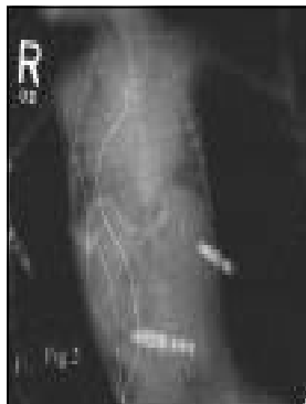
Figure 2 - Chest x-ray of patient 2 showing an enlarged cardiac shadow.

generalized edema, hypotension, metabolic acidosis and increased ventilatory requirements. The heart sounds were barely audible and the chest x-ray showed an enlarged cardiac shadow ( Figure 2 ). Pericardial effusion was suspected and was confirmed by echocardiography. Percutaneous pericardiocentesis was performed and 18 ml of turbid fluid was aspirated; later proven by amino acid analysis to be TPN. The line was removed and the patient survived.