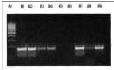
Figure 2 - Hepatitis B virus-polymerase chain reaction for chronic liver disease patients number 1 to 9.