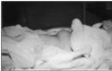
Figure 1 - Clinical photograph showing a right superior lumbar hernia.

potentially weak areas where a lumbar hernia can develop either through the superior lumbar triangle or through the inferior lumbar triangle. The superior lumbar triangle (Grynfeltt-Lesshaft triangle) is found between the inferior aspect of the 12th rib, the internal oblique muscle and the quadratus lumborum muscle. 2,9 A lumbar hernia may also occur, although less commonly through the inferior lumbar triangle (Petit triangle) which is bounded by the iliac crest inferiorly, the external oblique muscle anteriorly and the latissimus dorsi muscle posteriorly. 10 Sometimes congenital lumbar hernia may be diffuse involving most of the lumbar region. 6