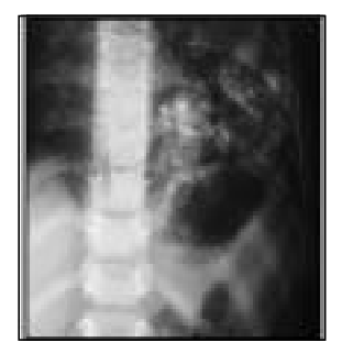
Figure 2 - High density of pulmonary lesions at left lower lobe are better appreciated in penetrated radiograph.