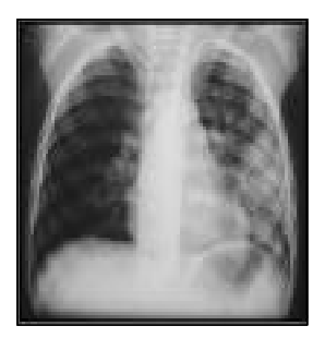
Figure 1 - Chest radiograph demonstrating alveolar lesions of lobar distribution at left mid and lower zone.

Radiology plays a vital role in the management of aspiration pneumonia. Assessment should include the distribution of the aspirated material, its density and the subsequent clearance pattern. Routine radiography of the chest is mandatory for a suspected episode of aspiration. Because of the high atomic number (z=56) retained barium particles or aggregates appear as dense punctate foci on chest radiographs. Computed tomography plays an additional role in demonstrating the interstitial