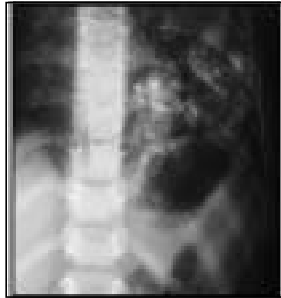
Figure 2 - High density of pulmonary lesions at left lower lobe are better appreciated in penetrated radiograph.