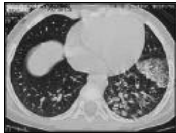
Figure 3 - An high-resolution computed tomography of lower chest demonstrating high density lesions at left lower lobe.