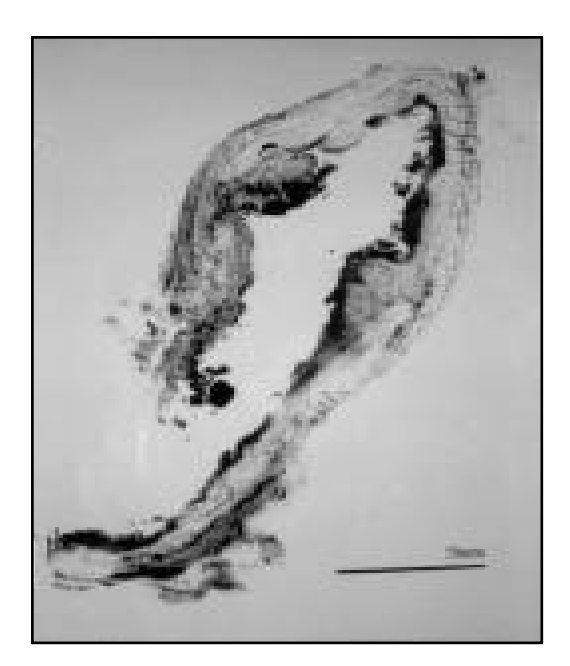
Figure 3 - The histopathologic view of the mass.

On CT images with 3D reconstruction, erosion of lateral part of condylar head was clearly detected. (Figure 2).