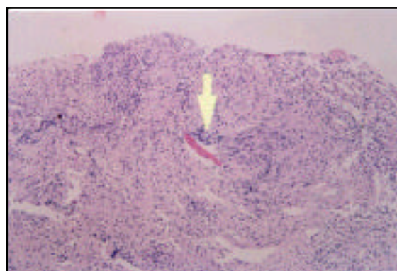
Figure 3 - Microphotograph showing inflamed cellular fibrous tissue covered by non-cornified squamous epithelium. A foreign body resembling bone like structure could be seen amidst the inflammatory cells.