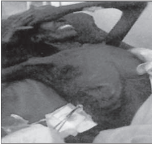
Figure 1 - Taenia saginata segment protruding from the drain site on the right side of the chest with an artery forceps holding the segment.