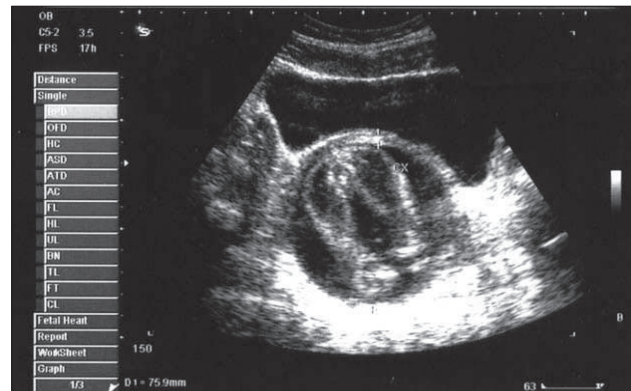
Figure 2 - Abdominal ultrasound showing an advanced cervical dilatation, bulging of membranes with prolapse of both lower limbs in the middle vagina (transverse scan).