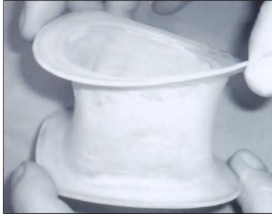
Figure 1 - Hand-made incision barrier.