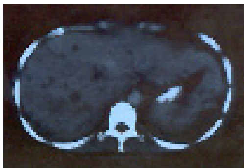
Figure 1 - Abdominal computerized tomography showing hepatosplenomegaly and multiple hypodense lesions with a maximal size of 2 cm in diameter.