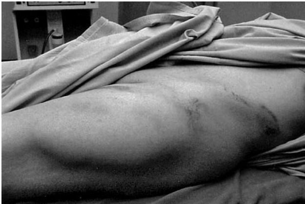
Figure 1 - Morel-Lavallee lesion located at the left thigh of the patient.

Discussion. Closed degloving injuries are an uncommon clinical condition. When we look at the literature about closed degloving injuries, the number of patients were changing between 5 and 24. 1,4,8-11 Although the number in our study is small, promising results were obtained when these injuries were managed with synthetic glue. Glubran 2 surgical glue exerts an adhesive and hemostatic action on tissues. It is used in open and laparoscopic surgery and in treating digestive tract endoscopy, interventional radiology and vascular neuroradiology. It may be applied alone or in combination with sutures, even in patients being treated