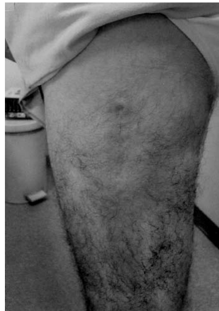
Figure 3 - After the operation the skin was checked for necrosis and infection.