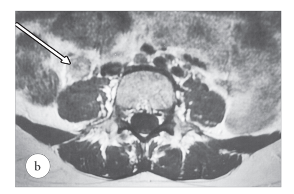
Figure 1 - T1 weighted magnetic resonance imaging showing a) a mass in relation with the right psoas muscle, which enhances on b) gadolinium contrast.