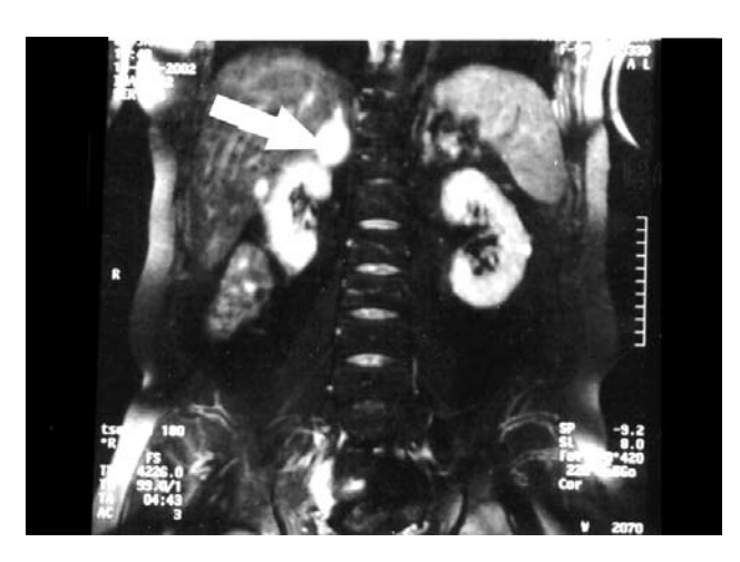
Figure 1 - T<sub>2</sub>-weighted magnetic resonance image demonstrating round homogeneous tumor with hyperintensity signal on the pole of the right kidney (arrow).

arising within the right adrenal gland was suspected. Following the administration of adequate alphareceptor blocking agents with phenoxybenzamine 60 mg/day, a beta-adrenoceptor blocker (propranolol) was added to the therapy and normotension was reached. Right adrenalectomy was performed by the transabdominal route under general anesthesia. Gross pathological appearance of postoperative resected right adrenal tumor was encapsulated, well-circumscribed, measuring 40 x 40 x 25 mm in dimension. The tumor showed a whitish grey and gelatinous appearance in the cut surface without evidence of hemorrhage or necrosis. Microscopically, the sections showed irregular proliferation by spindle shaped cells with scattered mature ganglion cells (Figure 2a). The spindle shaped cells stained strongly with monoclonal antibody to S-100 protein (Figure 2b) and the ganglion cells stained with monoclonal antibody to neuron-specific enolase, synaptophysin, and chromogranin-A. The histologic diagnosis was adrenal ganglioneuroma. Six weeks after the surgery, the patient was well and had no recurrence