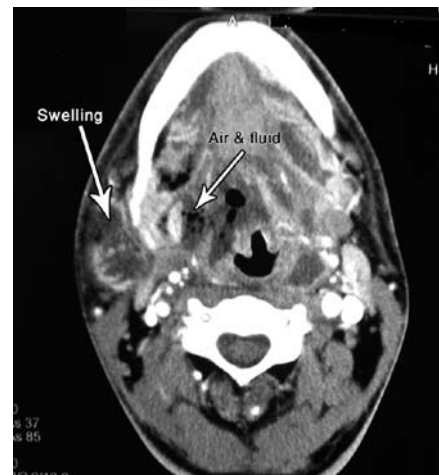
Figure 2 - Axial neck CT post-contrast shows right parapharyngeal heterogeneous soft tissue swelling with air and fluid collection at its center (abscess) extending laterally beside the right mandibular ramus. The lesion is associated with marked soft tissue edema extending to the epiglottic area.

spit fresh blood from the mouth in large amounts and his pulse became rapid and weak, 2 units of fresh blood was transfused to the patient. Cricothyroidotomy was performed and laryngoscopy revealed a blood clot on the right side of the soft palate near the upper pole of the tonsil. On its removal, profuse blood was started to come from 1x1 cm opening on the right side of the soft palate near the upper pole of the tonsil and the bleeding was controlled by application of Surgicel pack (Johnson & Johnson Medical Ltd, Gargrave, North Yorkshire, UK). Tracheostomy replaced the cricothyroidotomy. One hour later, the patient started to desaturate again and he had a cardiac arrest. Resuscitation was successful. Two hours later, rebleeding from the tracheostomy site occurred and was controlled. Then, after one