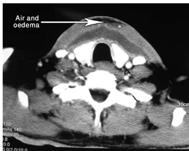
Figure 4 - Axial neck post-contrast CT shows subcutaneous air and the retro-sternal space soft tissue edema.

hour, rebleeding started from the nose. Diagnosis of disseminated intravascular coagulation was made clinically. One hour later, the patient died.