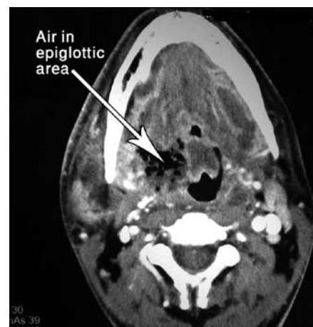
Figure 3 - Axial neck CT post-contrast shows right parapharyngeal air extending medially to the epiglottic area and glottic area.