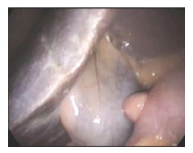
Figure 3 - Laparoscopic appearance of duodenal lipoma.