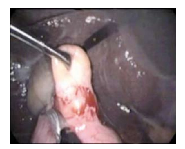
Figure 4 - Duodenal lipoma during excision.

Discussion. Lipomas are mesenchymal tumors commonly affecting the GI tract, they are the third most common benign tumor following leiomyomas and adenomas, and have a predilection for involving