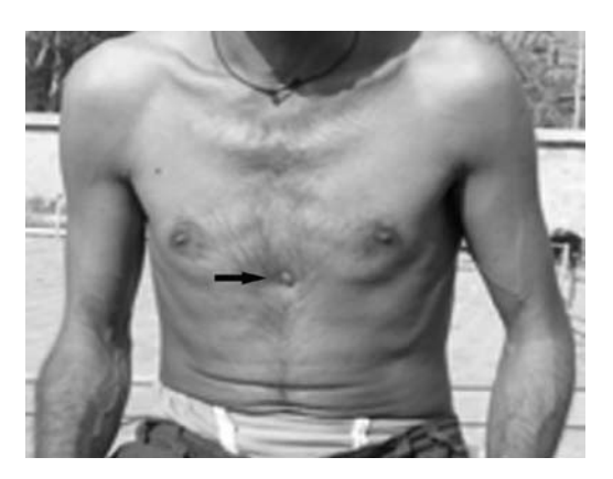
Figure 3 - Clinical photograph showing a chronic non healing sinus of the sternum.

40-60 years age group (63.15%) with age range 1-69 years (Table 2). The patients diagnosed with isolated sternal tuberculosis (19) were put on 12 months of ATT with 4 drugs (isoniazid, rifampicin, ethambutol, and pyrazinamide) for the first 3 months, and on 2 drugs (isoniazid, rifampicin) for the next 9 months. All the patients showed improvement within 2 weeks (average) of treatment in the form of decrease in discharge from the sinus, and retrosternal discomfort. There was an average gain of 5% of weight within 3 months of initiation of therapy. The swelling almost subsided