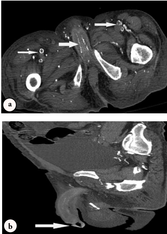
Figure 1 - Computed tomography scan of pelvis and upper thighs axial section a) and sagittal reconstruction b) shows diffuse and extensive calcification of the walls of small and medium-sized arteries including the iliac, femoral, pudendal, penile, dorsal penile and cavernosal arteries with almost complete obliteration of the lumen of small arteries. There is air in glans penis representing gangrenous changes on sagittal reconstruction.

speed of 12.5 on a 16 slice multidetector CT scanner (Milwaukee, WI, USA). Reconstruction in sagittal and coronal planes with 3D reconstruction for the penis region was also obtained. It showed diffuse and extensive calcification of the walls of the small and medium-sized arteries, with almost complete obliteration of the lumen of small arteries including the iliac, femoral, pudendal, penile, dorsal penile, and cavernosal arteries ( Figures 1a & 1b ). There was gangrenous involvement of the distal penis with soft tissue swelling, and air locules within the subcutaneous tissues. The 3D reconstruction of the penis using volume rendering technique, demonstrated the ulceration of glans penis in an exquisite manner ( Figure 2 ). The patient was started on antibiotics, and the penile lesion was débrided, and dressed. The wound healed well over a period of 2 weeks, and the patient went home still having severe pain, partially responding to narcotic analgesics.