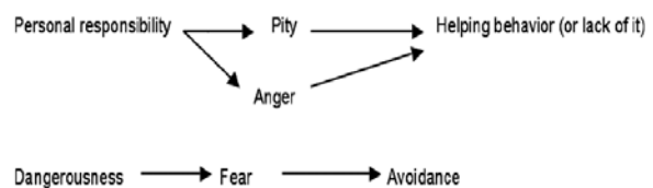
Figure 1 - The dangerousness and personal responsibility pathways.

Results. The percentage of respondents was 49%, and the respondents' demographics are illustrated in Table 1 . The main ethnicities were Arab/Middle Eastern, Filipino, Indian subcontinent, and Anglo-American. More than 50% of them had over 6 years professional experience, and 70% were females. The mean and standard deviation of answers to the questions are shown in Table 2 . The highest scores were found in the 2