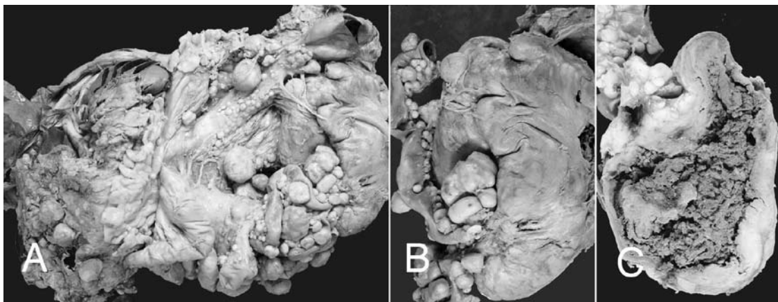
Figure 1 - Autopsy specimen demonstrating the a) numerous gray tan tumor implants of the omentum, mesentery and the serosal surfaces of both the large and small intestines. b) Largest tumor nodule surrounding the terminal ileum with other multiple implants on surface. c) Cut section of largest tumor nodule demonstrating the tract connecting the tumor necrotic center with the intestinal lumen.

Autopsy findings. The abdominal bloc contained numerous round, both sessile and pedunculated gray tan tumor implants of the omentum, mesentery and the serosal surfaces of both the large and small intestines (Figure 1a). The largest tumor nodule measured 19 x 14 x 8.0 cm and was attached to the ileum, 80 cm proximal to the ileocecal valve (Figure 1b). The cut surface of the tumor was necrotic and cystic. Focally, the tumor protruded into the lumen in "dumbbell" shape fashion with ulceration of the mucosa continuous with necrotic