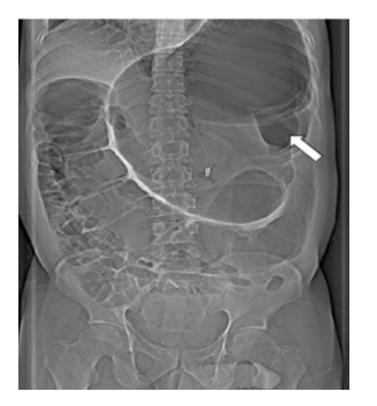
Figure 2 - CT scout film showing coffee bean shaped dilated splenic flexure with concavity of bean facing to the left upper abdomen (arrow). CT-computerised tomography.