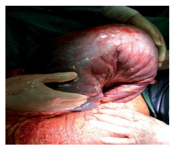
Figure 4 - Laparotomy revealing the distended gangrenous splenic flexure volvulus.