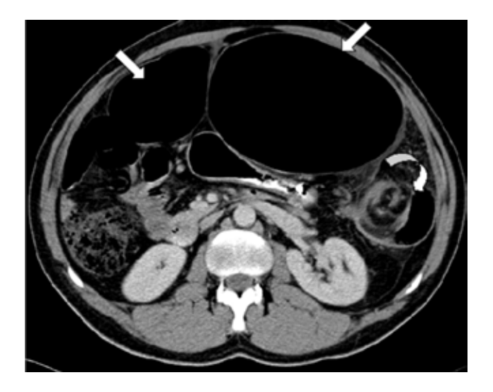
Figure 3 - CT scan revealing the 2 dilated loops of the splenic flexure (straight arrows) with the characteristic whirl sign (curved arrow). CT-computerised tomography.

separated air fluid levels, one in the distended splenic flexure and other in the cecum (Figure 1), and markedly dilated air filled colon in the left hypochondrium, and mid abdomen (Figure 2). This had a coffee bean appearance with concavity facing to the left upper abdomen causing elevation of left diaphragm, and abrupt termination at the anatomic splenic flexure (Figure 2). Volvulus of the splenic flexure of the colon was suspected, and a computerised tomography (CT) scan of the abdomen was performed. The CT scan confirmed the diagnosis of SFV, and showed a grossly dilated splenic flexure with a characteristic whirl sign at the site of twist of the mesentery (Figure 3). A diagnosis