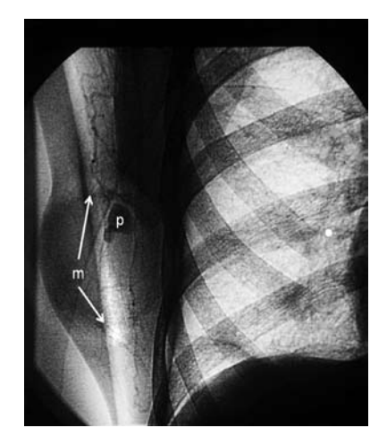
Figure 2 - Selective angiogram of right subscapular artery demonstrates pseudoaneurysmal sac (p) with the surrounding hematoma (m).