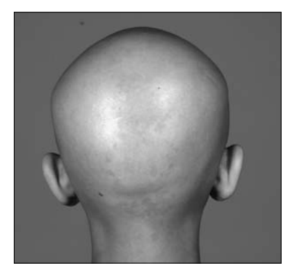
Figure 3 - Total loss of scalp hair in a patient with alopecia universalis.