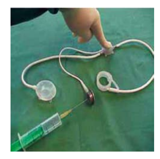
Figure 3 - The A.M.I. Soft Anal Band Implant is a manually operated system that is implanted subcutaneously. Twenty ml of sterile water is needed to achieve proper closing pressure.

all studies presented fecal incontinence scores before and after implantation, as well as statistical analysis not conducted on an intention-to-treat basis (except one study<sup>47</sup>). Table 2 summarizes the clinical trials results, assessing continence after the device was implanted. Most studies have also shown an increase in resting pressure after artificial anal sphincter implantation. However, changes in squeeze pressures were more equivocal.<sup>55</sup> Wong et al<sup>47</sup> implanted 112 Acticon® ABS's in a multicenter cohort study. Eighty-five percent had a functioning device and improved from a mean baseline incontinence score of 106 to 54 postoperatively. Continence rates after Acticon® ABS implantation remarkably improved to between 75-100% for solids, and 50-66% for gas. Parker et al<sup>60</sup> identified 2 patient