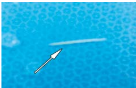
Figure 4 - Sharp, linear, serrated wood foreign body.

muscle (Figure 3), the carotid sheath was opened and the IJV vein ligated distal to the thrombus. The FB was removed and was found to be a piece of green wood (Figure 4) from a palm tree used in the preparation of meat recipes in rural areas. She made a full recovery.