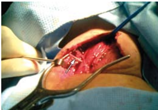
Figure 3 - Left neck exploration of a foreign body.