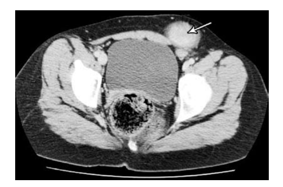
Figure 1 - A computed tomography scan showing the mass (arrow).

The patient was followed up in the outpatient clinic at one week, one month, and 3 months with no evidence of recurrence, or any other complication. In