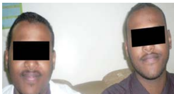
Figure 7 - Differences in skin color between the identical twins as seen visually and by photos, and confirmed by skin typing (skin color type: left - 3.74, and right - 3.56).