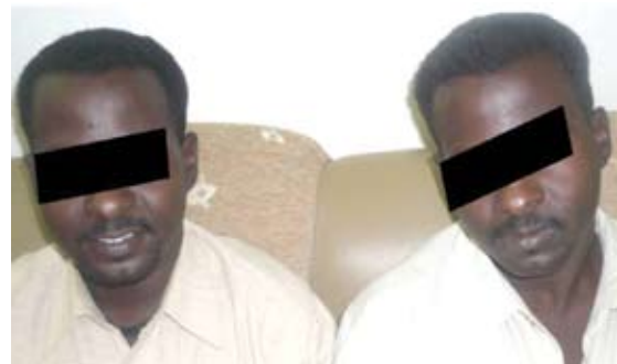
Figure 5 - Differences in skin color between identical twins as seen visually and by photos as confirmed by skin color typing (skin color type: left - 4.68, and right - 4.36).