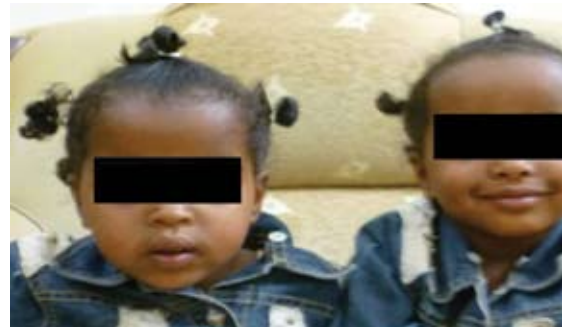
Figure 3 - Differences in skin color between the identical twins as seen visually and by photos, and confirmed by skin typing (skin color type: left - 3.62, and right - 3.81)