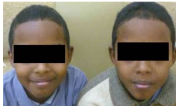
Figure 4 - Differences in skin color between identical twins as seen visually and by photos as confirmed by skin color typing (skin color type: left - 4.49, and right - 4.35).