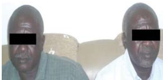
Figure 6 - Differences in skin color between identical twins as seen visually and by photos as confirmed by skin color typing (skin color type: left - 4.73, and right - 4.47).