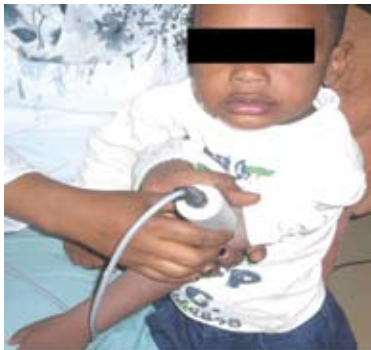
Figure 1 - The procedure of skin color reading using Medisun skin check device.