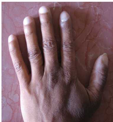
Figure 4 - A photograph showing the short fingers of the patient.

*These measurement revealed marked anemia of microcytic hypochromic nature. † Leukocyte series showed neutrophilia and mild lymphocytopenia. ‡ These features are pathognomonic for progeria, in which elevated platelet count and prothrombin time, and decreased high density lipoprotein is seen. § These parameters are pathognomonic for glomerulonephritis. ** These markers are suggestive of hepatic disorders. †† These revealed reduced immunity. ††† These revealed hypogonadism. §§ The presence of elevated antibody titer signifies beta hemolytic streptococcal infection. IU/l - international unit per liter, IU/ml - international unit per milliliter, ng/dl - nanogram per deciliter, HPF - high power field, mg/dl - milligram per deciliter