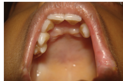
Figure 3 - Intraoral examination showing ogival palate and generalized pallor of the oral mucosa.

In general management, Asthalin nebulization was carried out 3 times daily for 6 days. Also Ventryl syrup 7.5 ml 3 times daily for 12 days was given, Supracef injection 250 mg intravenous 3 times daily for 11 days, injection Gentamycin 40 mg intravenous twice daily for 9 days, high dose steroids, along with which Tab Becosules and Cap Zevit was given once daily for 30 days. One week after the therapy, respiratory distress was resolved, and renal function was restored. Treatment for anemia was started with both intravenous and oral supplements. His condition remained stable one month following the treatment. He was sent for multidisciplinary approach, which included total extraction of his teeth, and thereafter oral rehabilitation with complete denture. However, he refused to undergo treatment.