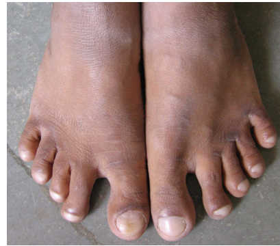
Figure 5 - A photograph showing the short toes of the patient.