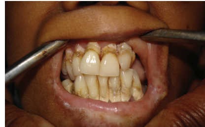
Figure 2 - Intraoral examination showing severe periodontitis, crowding, angular cheilitis and hypopigmented upper and lower lips.