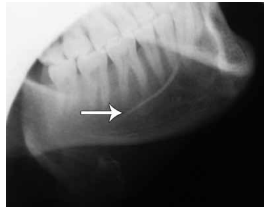
Figure 2 - Sialogram view of the right submandibular gland shows dead end of the submandibular gland duct (arrowed).