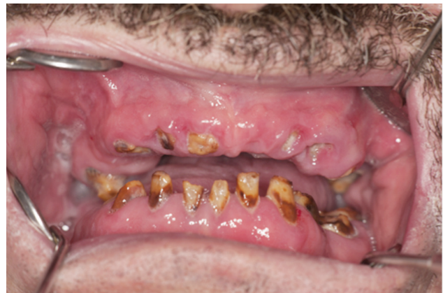
Figure 1 - Clinical picture of the patient during the examination, revealed the presence of numerous residual roots in the upper jaw and multiple lesions of inflamed oral mucosa in the lower jaw.

He underwent postoperative follow-up examinations (on the third, seventh, and fourteenth day after surgery) when bio-oxygenation therapy and clinical evaluation of wound healing were performed. Wound healing evaluation showed that healing was without complications. Healing of the wound was assessed by an experienced surgeon who did not perform the surgical procedures or post surgical therapy. Before the assessment of the degree of wound healing in the patient, the same specialist from oral surgery department assessed 25 wound images of different degrees of wound healing twice in 7 days between the 2 assessments. However, images were presented in different order and properly labeled. The Kappa test revealed no significant difference between the 2 assessments (Kappa value = 0.921), which represents the uniformity of assessments.