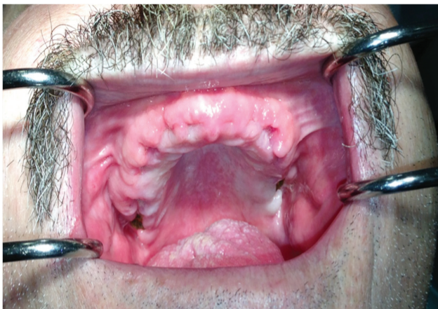
Figure 3 - On the fourteenth postoperative day, the control with the application of bio-oxygenation therapy.