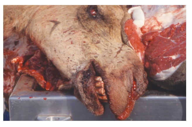
Figure 5 - Unclotted blood protrudes from the nose of a dromedary with anthrax.

Anthrax remains a threat to livestock in African and Asian countries where control depends on proper vaccination and disposal/decontamination of carcasses. In developed countries, the disease is rare. Animals contact Anthrax by ingesting spores, especially when the grazing animal bites off the pasture grass at ground level during periods of food scarcity. Inhaled contaminated dust can also lead to pulmonary anthrax. Humans become infected via contact with diseased animals or hides or as a consequence of bio terrorism, which was experienced in 2001.<sup>5</sup> Rare cases have been diagnosed in