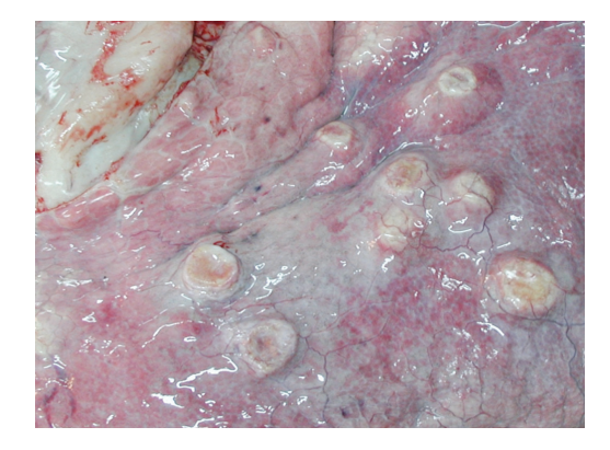
Figure 6 - Hydatid cysts in the lung of a dromedary.

Conclusion and recommendations. Numerous zoonotic diseases cause morbidity, mortality, and productivity losses not only in humans, but also in livestock and wildlife populations all over the world including the Arabian Peninsula. These diseases may have large social impacts in endemic areas. Several of these zoonotic diseases have been introduced from other countries into the Arabian Peninsula due to lack of stringent import regulations or lack of implementing them. Typical recent examples are outbreaks of RVF, CCHF, avian influenza, and glanders into the Arabian Peninsula. Mycobacteriosis and brucellosis as well as leishmaniasis are further examples of this situation. Uncontrolled trade of live dromedaries for example from East African countries where a seroprevalence of brucellosis may reach 40% contribute to a rise of zoonotic diseases in the imported countries. Not only zoonotic diseases have been introduced from Africa and Asia into the Arabian Peninsula, but also other diseases such as foot-and-mouth with severe consequences for the livestock industry. Serotypes completely unknown