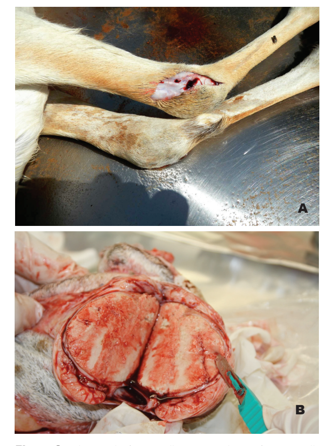
Figure 2 - Photograph of a: A) swollen metacarpal joint of a reem gazelle ( Gazella subgutterosa marica ) from which Brucella melitensis was isolated. B) Severe orchitis of an Oryx antelope ( Oryx leucoryx ) from which Brucella melitensis was isolated. Both animals were seropositive and originated from the United Arab Emirates.

Most human brucellosis cases on the Arabian Peninsula are caused by the consumption of unpasteurized milk. Brucellosis has been recently highlighted in Hajj pilgrims following camel milk consumption.<sup>22</sup> The authors recommend that Hajj pilgrims should not consume unpasteurized dairy products. This recommendation should include all people who consume milk and milk products. In 2003 in Saudi Arabia alone 4534 human brucellosis cases were reported.<sup>23</sup> Radwan et al<sup>24</sup> who examined a large dromedary herd of 2536 animals in Saudi Arabia with a 12% abortion rate and an 8% seroprevalence, diagnosed Malta fever in 30% of camel handlers. Brucella melitensis