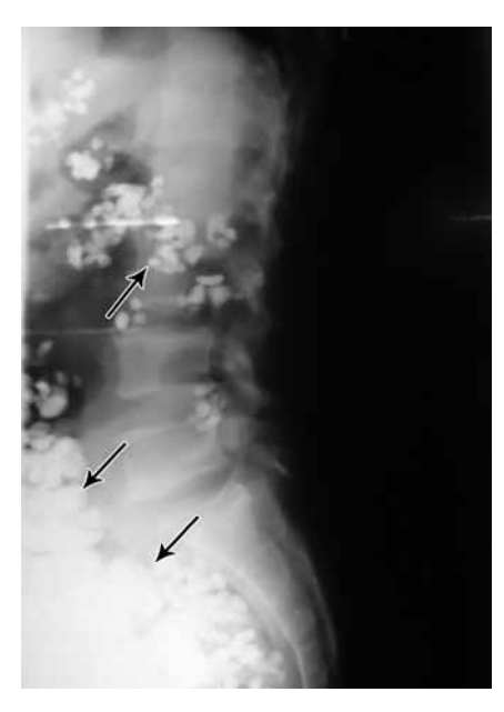
Figure 1 - Lateral view of the spine showing multiple radio-opaque filling defects in the rectum, sigmoid, and descending colon.

prior to presentation, and he had become socially isolated with emotional lability since then. He was treated with lactulose laxative and paraffin oil. One week later, the symptoms resolved and he was pain-free. Post evacuation plain x-ray did not reveal any residual stones in the colon (Figure 3). A psychiatric assessment