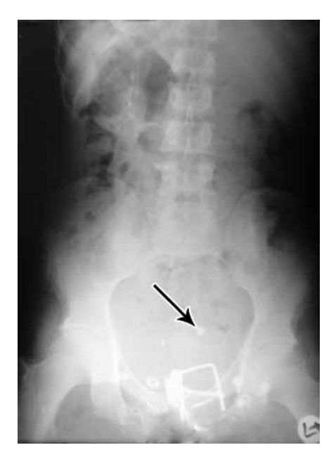
Figure 3 - A plain abdomen x-ray of the same patient, one week after treatment showing just a few radio-opaque filling defects in the rectosigmoid colon.

Lithobezoars are rare types of bezoars, and we were only able to find very few reported cases on literature review.<sup>3-9</sup> Lithobezoars are more common in males and usually found among psychiatric patients.<sup>4</sup> The "colonic