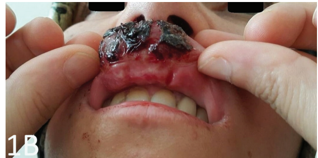
Figure 1 - : Extragenital chancre on the upper lip.