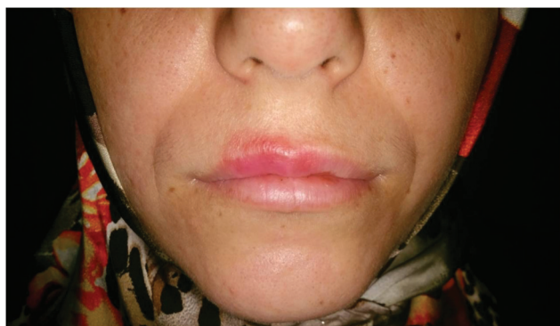
Figure 4 - The patient's ulcer regressed completely after treatment

The VDRL titres of the patient became negative in 4 months. When the patient's husband was invited to the clinic to be evaluated for syphilis, it was noted that he had lesions in the oral mucosa consistent with mucoid plaques; he had been diagnosed with secondary syphilis, and given benzathine penicillin G in 2.4 million units intramuscularly as a single dose for treatment and had been following up at the infection clinic. He was also immunocompetent (HIV test: Negative). At the third month of the follow-up, it was observed that the patient's oral ulcer completely regressed, with slight pigmentation remaining (Figure 4). The intergluteal lesion regressed as well.