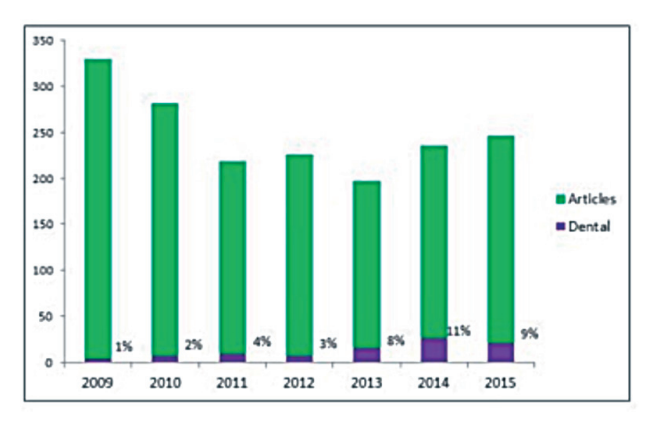
Figure 3 - Percentage of published dental papers from the total number of papers published per year in the Saudi Medical Journal between 2009 and 2015.

This can result in an increase in the rate of duplicate publication or salami slicing, a major headache for editors. The issues of falsification of reports, fabrication of the results, and plagiarism are, unfortunately, not uncommon in Saudi Arabia, and despite the signing of declarations during the initial submission, a requirement of SMJ, a number of authors have been involved in such types of academic dishonesty.