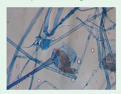
Rhizopus spp. grown from intraoperatively obtained lung tissue specimen

Al-Otaibi et al discuses that Mucormycosis is a rare opportunistic fungal infection that occurs in certain immunocompromised patients. They present 2 cases of invasive mucormycosis due to Rhizopus spp. in patients with chronic granulomatous disease (CGD) and discuss their clinical presentation, management challenges, and outcomes.