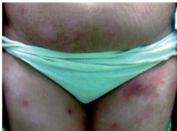
Figure 2 - Mycosis fungoides, an erythematous scaly patch in the upper part of left thigh in a 31 years-old female during pregnancy.

progression to advanced stages (Table 2). Most relapse cases occurred in the first 2 months after childbirth; however, 2 cases showed progression (patient 3) and relapse (patient 6) of disease during pregnancy. The patient who was diagnosed as stage IIIa before pregnancy refused the recommended treatment during pregnancy, but underwent combination chemotherapy during the puerperium period. Other patients who had flares shortly after delivery were treated with narrow-band ultraviolet B phototherapy. All patients had normal pregnancy and normal delivery, except for one ectopic pregnancy (patient 2). No complications were observed during the gestational period. The outcomes of the 7 pregnancies were normal and healthy neonates were delivered (Table 2).