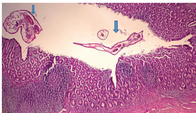
Figure 1 - Structures consistent with lymphoid hyperplasia of the appendix and Enterobius vermicularis within the lumen (arrows) (40x, stained with hematoxylin and eosin)