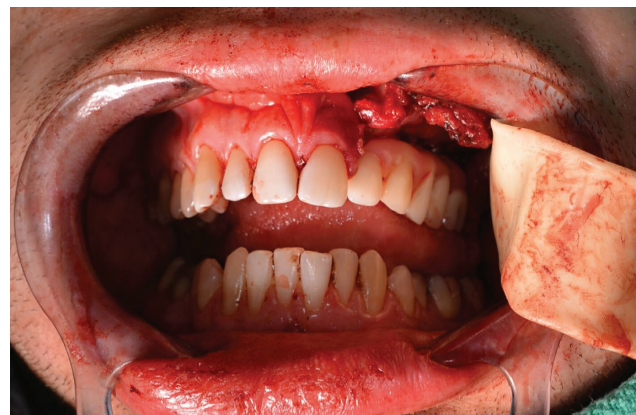
Figure 3 - Provisional prosthesis facilitates correct positioning of the graft.