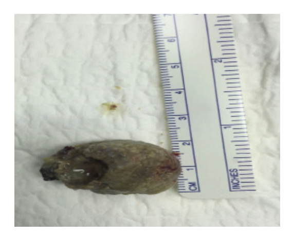
Figure 4 - Tonsillolith measured 3.1 \times 2.3 cm.

calculi. One hypothesis attributes stone formation to recurrent tonsillitis and subsequent crypt fibrosis that lead to epithelial cell retention, which creates an environment for microorganism overgrowth and calcification due to deposition of inorganic salts from salivary gland secretions.<sup>5</sup> Stoodley et al<sup>6</sup> concluded that tonsilloliths share common characteristics with biofilms. Biofilms are aggregates of aerobic and non-aerobic microorganisms enclosed in an extracellular matrix. Due to the nature of biofilms, it is difficult to treat the microorganisms with antibiotics. In fact, a biofilm serves as a nidus for acute infections rendering it a source of recurrent ENT infections.7 Cases of giant tonsillolith have not been reported in Saudi Arabia. Literature review shows that the largest tonsillolith was reported in a 12-year-old female child in the left tonsil and measured 4.2 × 3.6 × 2.1 cm. A majority of the cases of giant tonsilloliths reported a left tonsil stone rather than the right. Two reported cases showed bilateral giant tonsilloliths.<sup>8,9</sup> A patient with tonsillar stone is approached through history taking, physical examination, and imaging studies. A giant tonsillolith