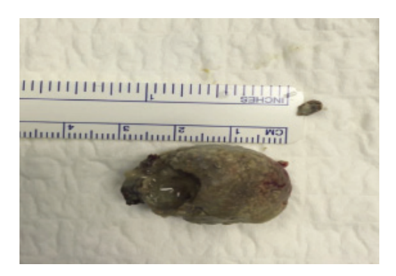
Figure 3 - Tonsillolith measured 3.1 \times 2.3 cm.