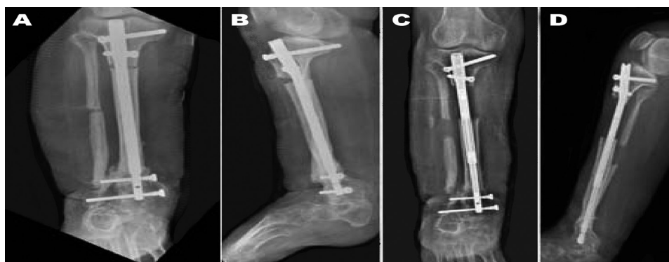
Figure 2 - The Precice nail was inserted into the right tibia under anesthesia: anteroposterior direct x-ray view (A), lateral x-ray view (B). After 50 mm of lengthening had been completed: anteroposterior direct x-ray view (C), and lateral x-ray view (D).