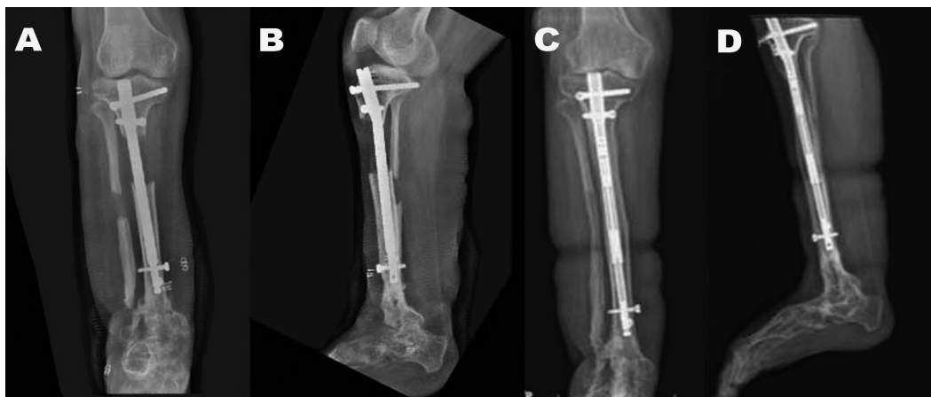
Figure 4 - Once the nail shortening was complete, the distal interlocking screws were placed, and the unilateral external fixator was removed under anesthesia: anteroposterior direct x-ray view (A) and lateral x-ray view (B). A total lengthening of 100 mm was obtained with the nail, the maximum capacity of which allows for 50 mm of lengthening: anteroposterior direct X-ray view (C) and lateral X-ray view (D).