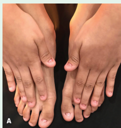
Total anonychia of all nails of fingers and toes of patient

Bin Nooh et al present 3 cases with anonychia congenita appearing in different generations of a single family in Kingdom of Saudi Arabia. Anonychia refers to the absence of nail plates owing to an autosomal dominant or recessive inheritance. Congenital anonychia is a rare condition that may be associated with other ectodermal or mesodermal malformations like epidermolysis bullosa, (deafness, onychodystrophy, osteodystrophy, and mental retardation) syndrome and Iso-Kikuchi syndrome. Genetic analysis will be employed to confirm the diagnosis.