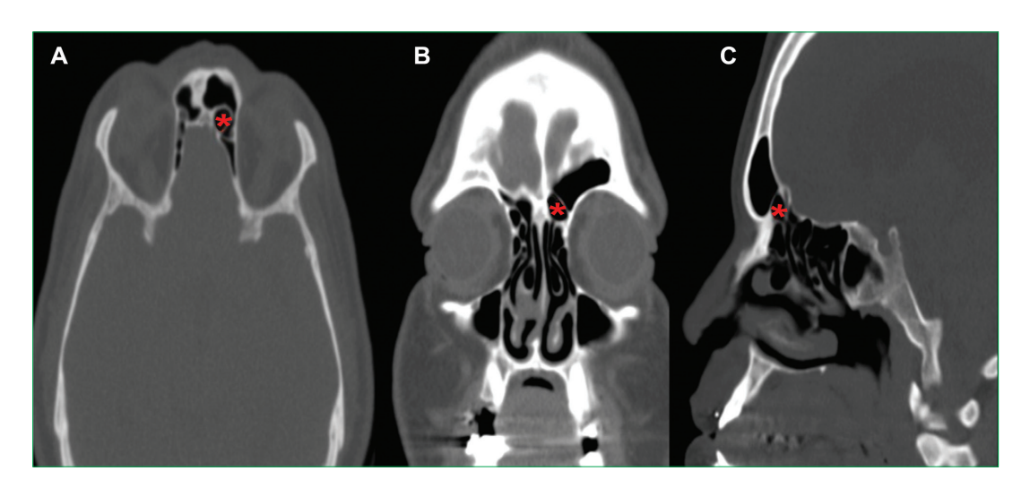
Figure 2 - Computed tomography scan of frontal septal cell showing the A) axial plane, B) coronal plane, C) sagittal plane .

Values are presented as numbers and percentages (%). *Mc-Nemar test, †significant p-values