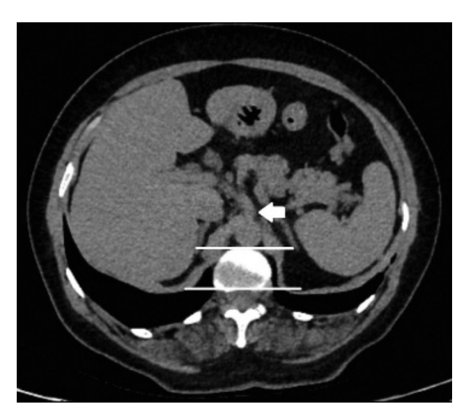
Figure 1 - Points of diaphragm thickness measurements. Axial computed tomography scan at the celiac artery origin level (white arrow). Anterior and middle diaphragm thickness measurement points (white lines).

Results. The study included 94 COVID-19 patients who stayed in the ICU and met the study criteria. The median age was 69 (27-90) years. The patients' demographic details and comorbidities are shown