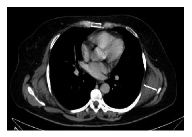
Figure 2 - Axial contrast-enhanced computed tomography scan of the chest of one 69-year-old woman with colon cancer for staging, demonstrating bilateral elastofibroma dorsi. Lesion thickness was taken using the maximum axial dimension (bold white line).

and EFD occurrence site. A correlation coefficient was used to determine the linear relationship between the two variables. Pearson's chi-squared statistic was used for group-to-group comparisons. A p -value of <0.05 indicated a statistically significant difference.