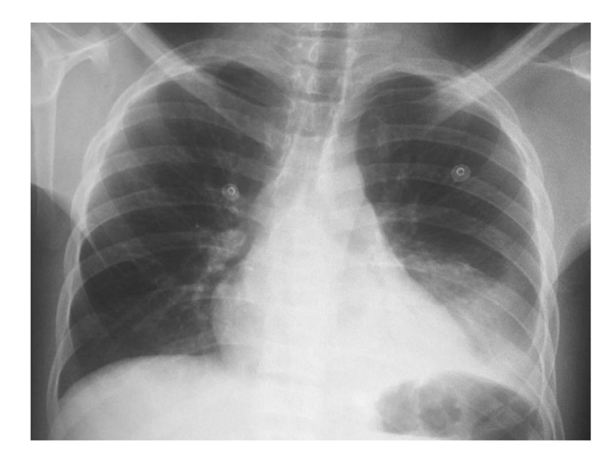
Figure 2 - Chest X-ray demonstrate left lower lobe opacification with minimal pleural effusion in a 16 years sickle cell disease patient presented with acute chest syndrome. The patient improved markedly after exchange blood transfusion.