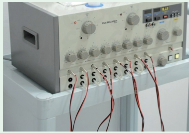
Silver Spike Point device.

Al-Zalabani review and summarize the evidence for the efficacy of electrical stimulation, including Silver Spike Point therapy, in smoking cessation. The current best available evidence does not support the use of electrical stimulation, including Silver Spike Point therapy, in smoking cessation. Policy makers and healthcare providers should aim to utilize the available resources to provide evidence-based treatment options for patients seeking to quit tobacco use. Smoking cessation services are part of the armamentarium to combat smoking epidemic. In addition to the approved treatments, alternative therapies, including electrical stimulation, have been proposed.