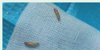
Multiple moving maggots extracted from the ulcer.

Alsaedi et al report a case of scalp wound myiasis in a patient with pemphigus vulgaris caused by M. domestica in Riyadh, Saudi Arabia. Cases of M. domestica myiasis are limited in the literature. They concluded that awareness should be raised regarding the possibility of cutaneous myiasis in Musca domestica in Riyadh, Saudi Arabia. At risk individuals need to be educated regarding wound dressing and prevention of such infestations. Therefore, neglected wounds, chronic necrotic cutaneous lesions, and poor hygiene are favorable conditions for housefly myiasis.